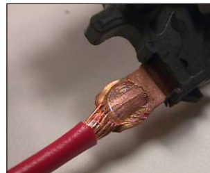
Stranded Wire to Coil