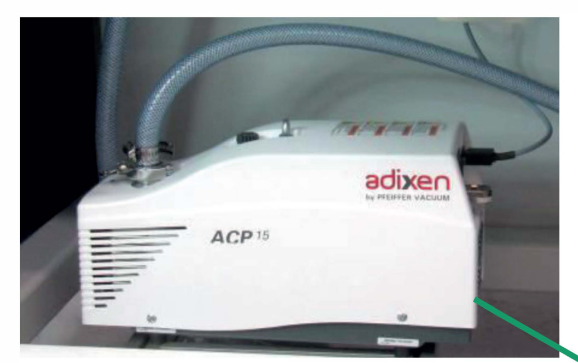
Vacuum chamber pump inside NOVA-6