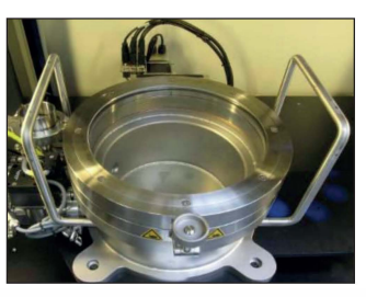
Vacuum chamber in closed position